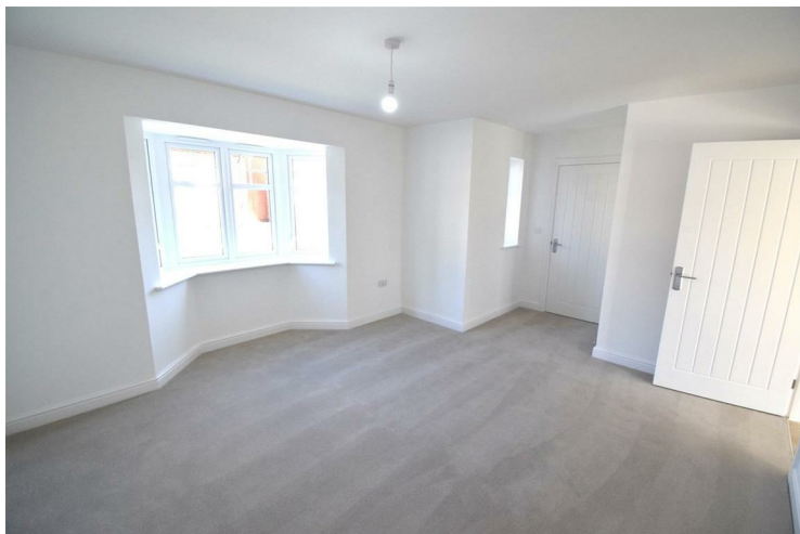
Lounge 13'5" x 12'1" (+bay) (4.11 x 3.69 (+bay))