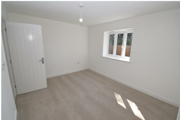
Master Bedroom 12'6" x 12'10" > 10'3" (3.82 x 3.93 > 3.13)