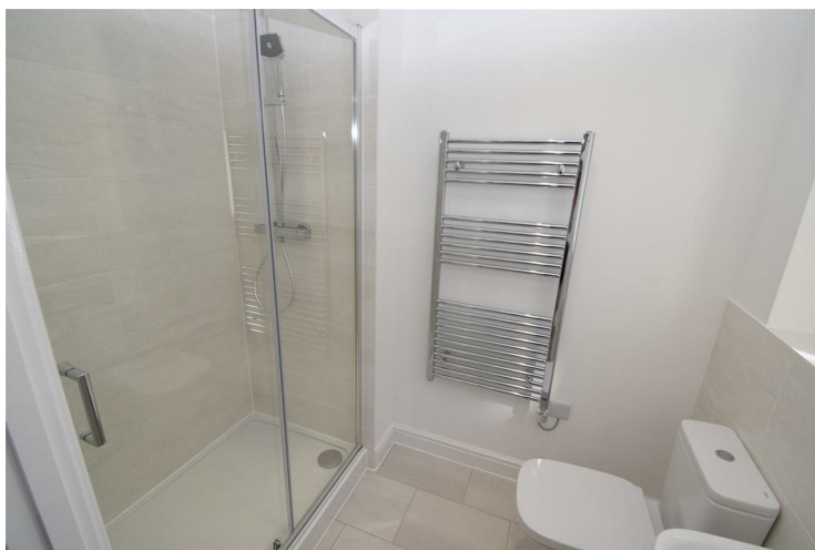
En-Suite Shower Room 7'1" x 4'8" (2.18 x 1.43)