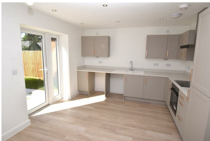
Kitchen/Diner 14'7" x 11'6" (4.46 x 3.52)